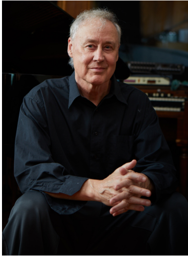
Bruce Hornsby, guest artist

Bruce Hornsby has built one of the most diverse, collaborative and adventurous careers in contemporary music. Drawing from a vast wellspring of American musical traditions, the singer/pianist/composer/bandleader has created a large and accomplished body of work and employed a vast array of stylistic approaches. Throughout this period, Hornsby has maintained the integrity, virtuosity and artistic curiosity that have been hallmarks of his work from the start.