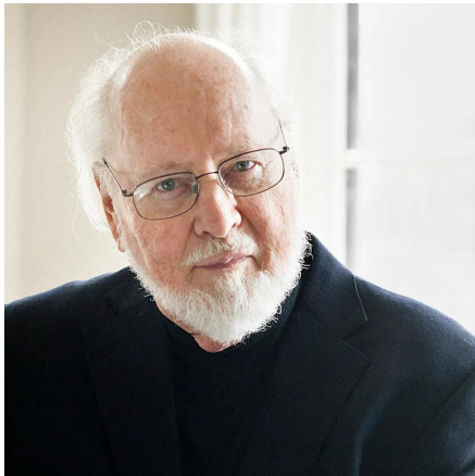
John Williams, composer